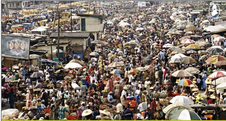
1. Sustainable Business Case for Change