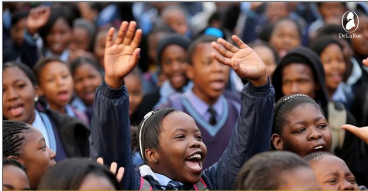
3. Investment Models for Growth