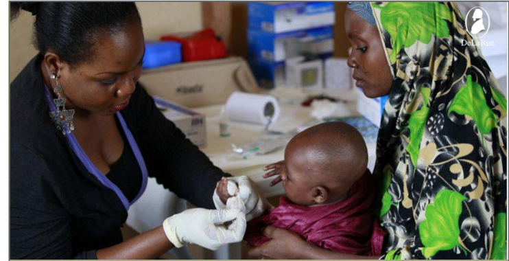
2. Economic Business Case