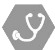
Cause of death

Are we being successful at implementing and improving CRVS in a financially sustainable way?