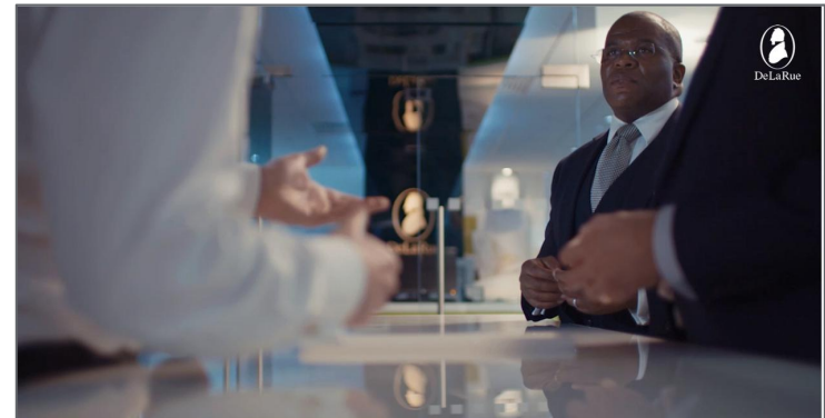
4. Work together