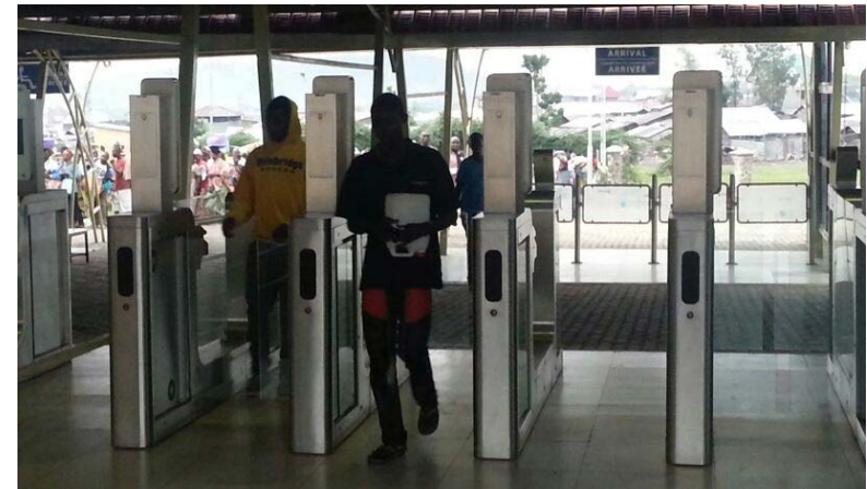
March 2018 Sample records (Gate3)