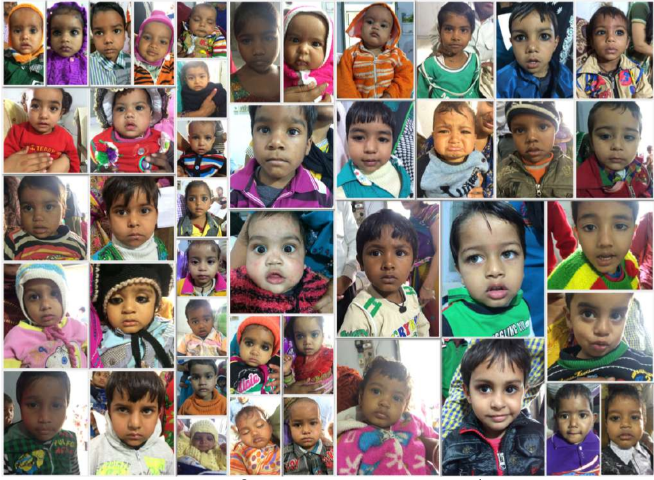
Infants: 0 to 12 months

What is the youngest age at which we can recognize a child?