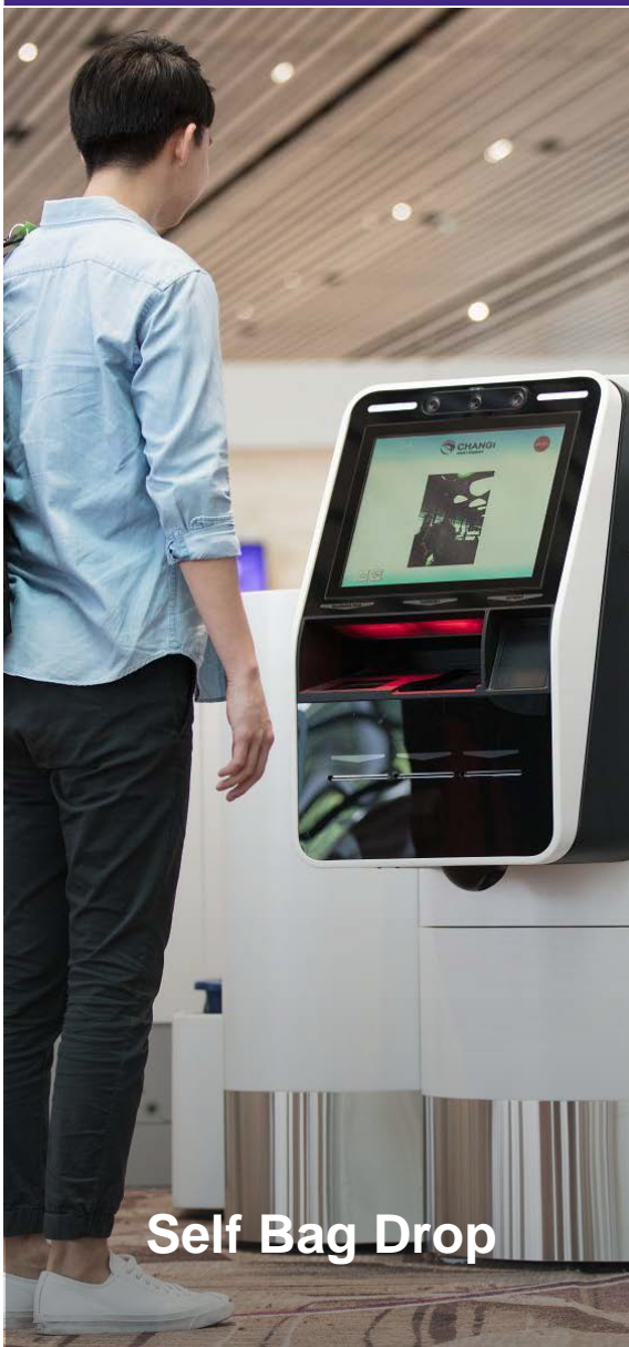
Self Bag Drop