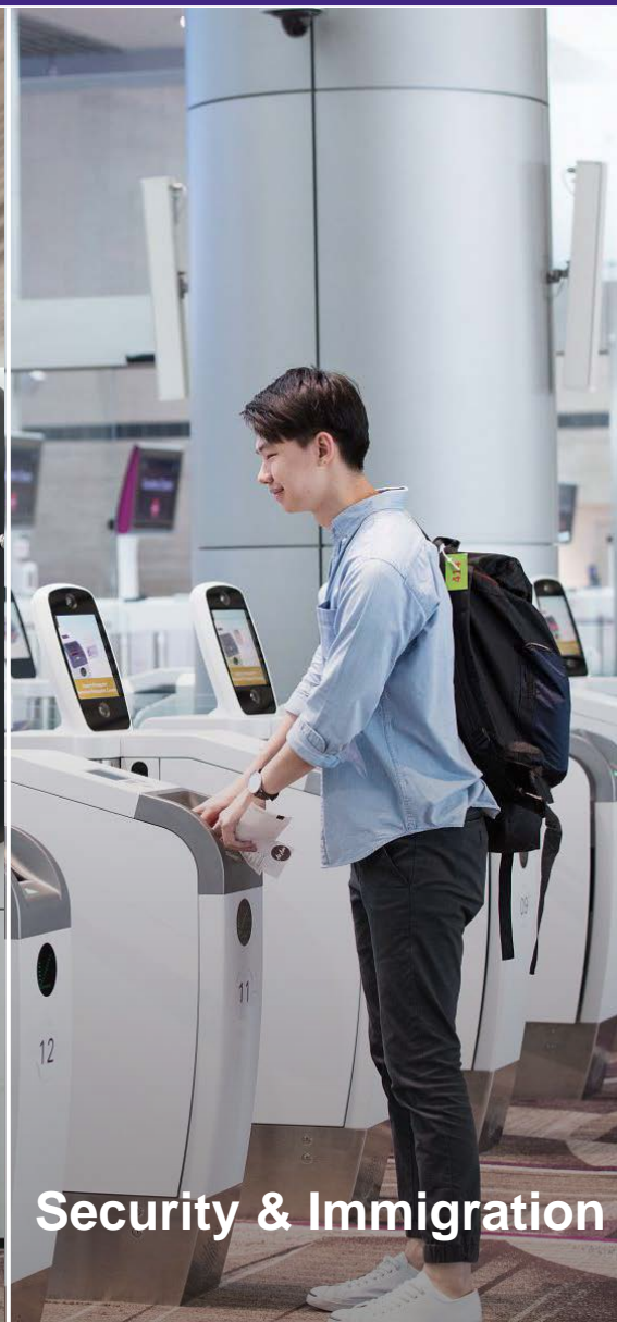
Security & Immigration