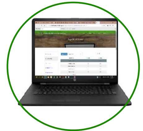
Referred Visa (e-Visa)