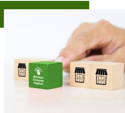
Other core platforms are Identity Mgt. (BVN), ACH, and Fraud Management (HAWK)