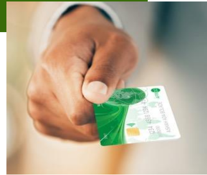
Delivered Nigerian's Domestic Card Scheme (AfriGO)