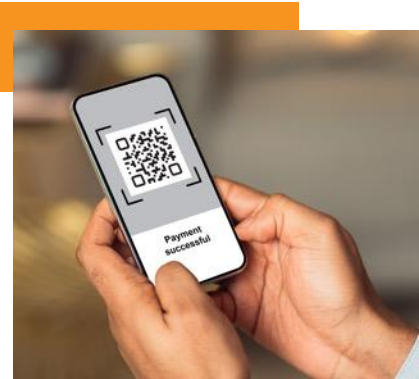
Delivered the first Account based instant payments and QR Payment